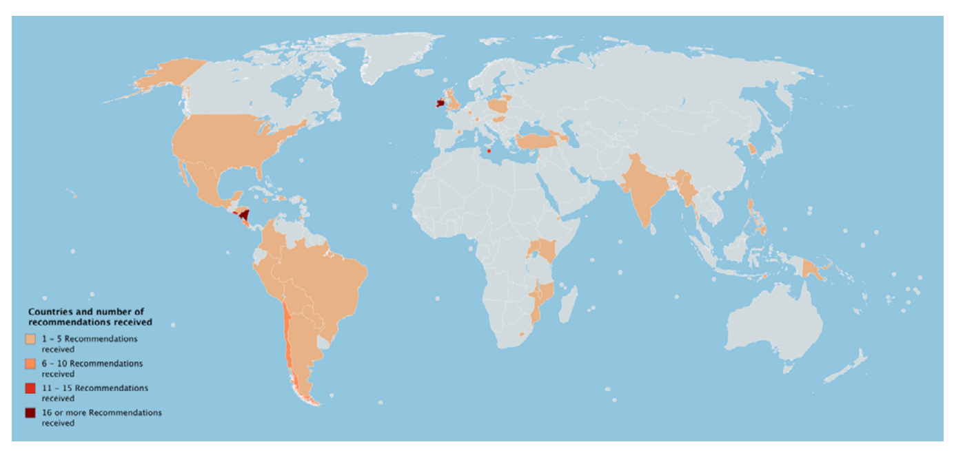
Figure 1: Countries that received recommendations on abortion and the number of recommendations received

cycle (2008-2011) there were 30 recommendations on abortion; in the second cycle (2012-2016), there were 115 – almost four times the number registered for the first cycle.