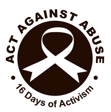
25 November - 10 December

We wish all our readers a happy and safe holiday season.