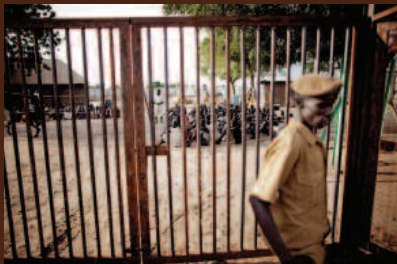
Inmates in Bentiu Prison, Unity State, lining up for the evening prisoner count before entering the cells for the night. There are approximately 250 prisoners in Bentiu Prison.

In the face of severe underdevelopment and myriad long-term challenges, South Sudan’s leaders have voiced their commitment to uphold human rights. The government should urgently work to reduce arbitrary detentions by enacting legal and policy reforms that limit remand detention and end imprisonment for adultery and for non-payment of debts. It should also find a way to guarantee the right to legal aid, to ensure rule of law actors are sufficiently trained, and to provide proper care for people with mental disabilities outside of prison.