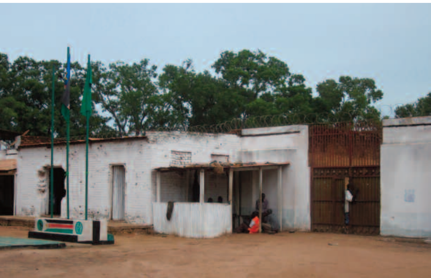
Rumbek Central Prison in Lakes State, South Sudan. At the time this photo was taken in August 2011, the prison housed 547 prisoners.