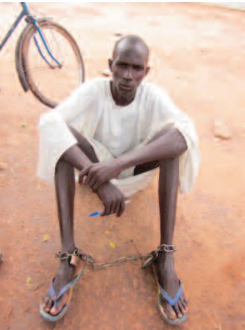
This 40-year-old man was put in shackles upon his arrival at Rumbek Central Prison. When Human Rights Watch met him, he had been in prison and chained for more than seven months while he awaited trial.