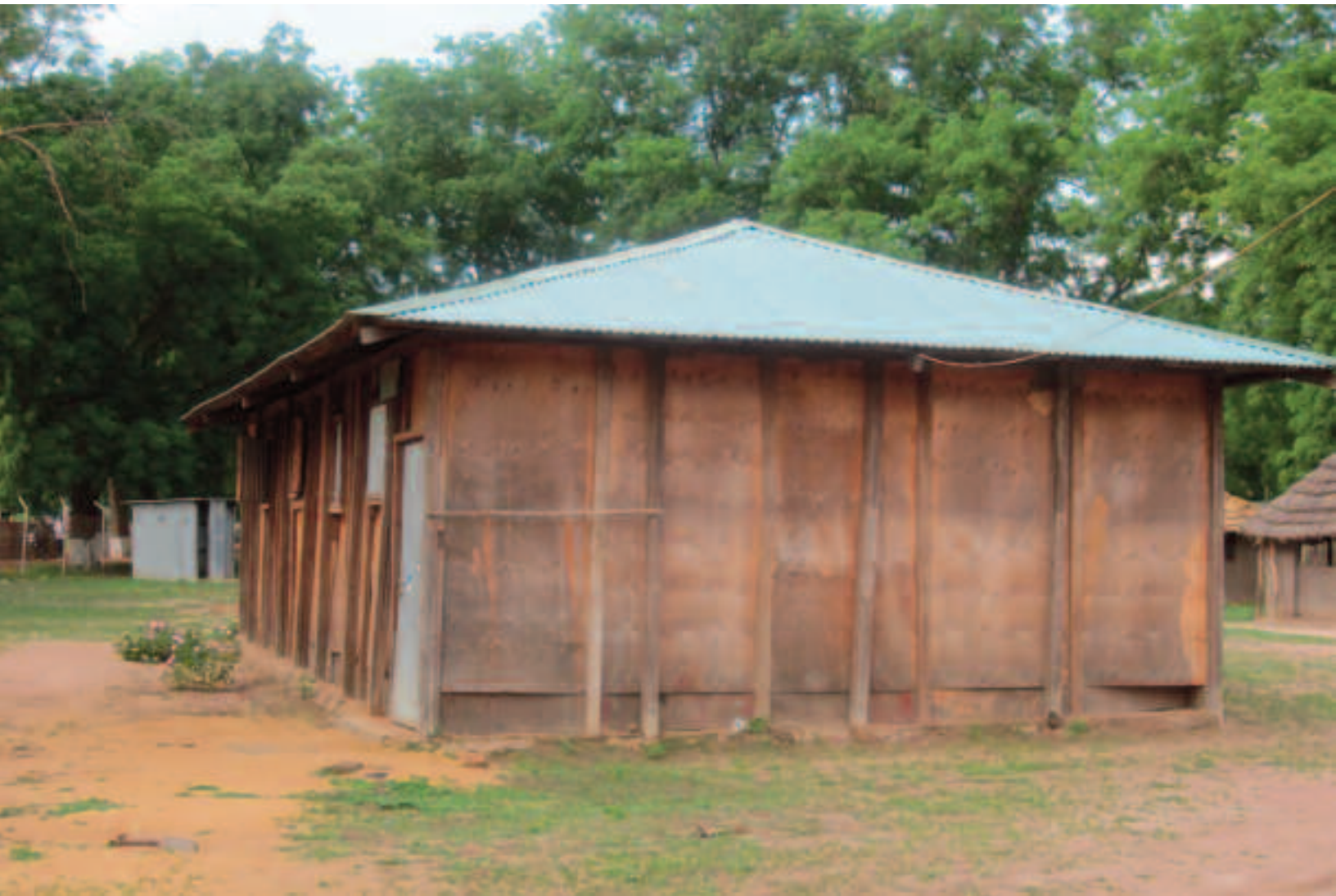
(above) The Lakes State High Court in Rumbek. South Sudan's statutory justice system faces numerous challenges, including inadequate court infrastructure, and staff shortages.