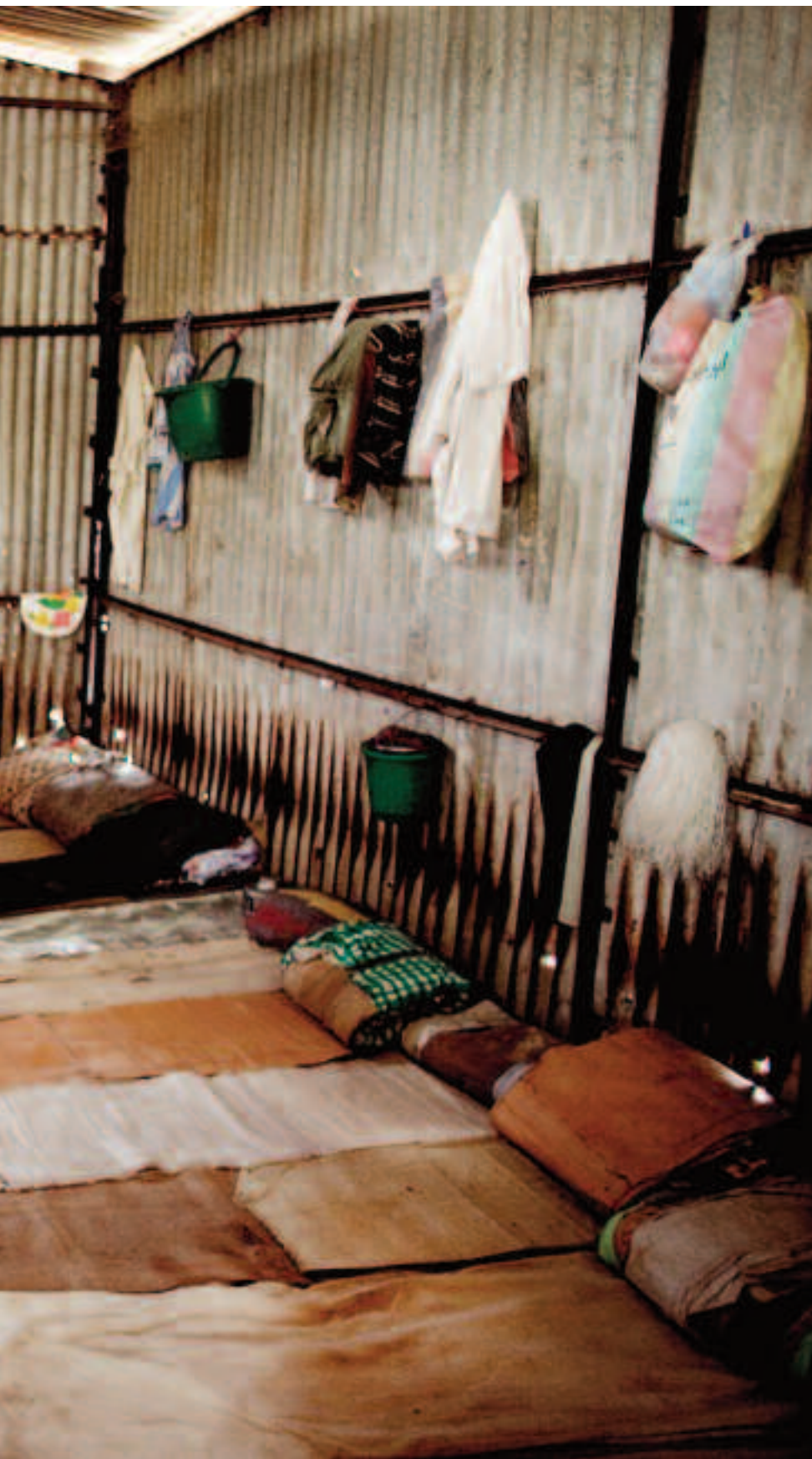
A cell in Bentiu Prison built entirely of corrugated iron sheeting. Few prisoners have mattresses; most sleep on a single sheet or an old food sack. Ventilation is poor, and prisoners complained that it is very hot at night.