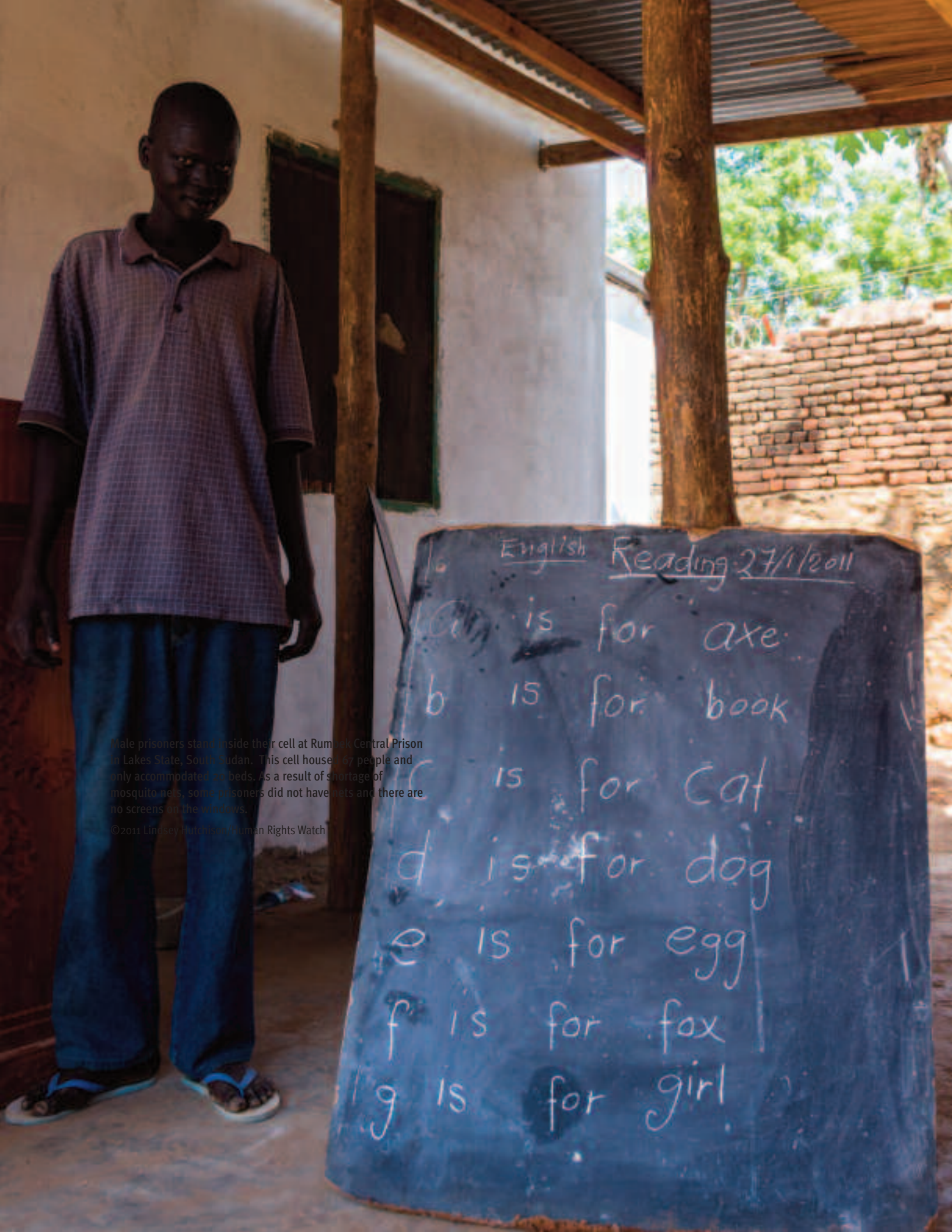
Male prisoners stand inside their cell at Rumbek Central Prison in Lakes State, South Sudan. This cell houses 67 people and only accommodates 20 beds. As a result of shortage of mosquito nets, some prisoners did not have nets and there are no screens on the windows.