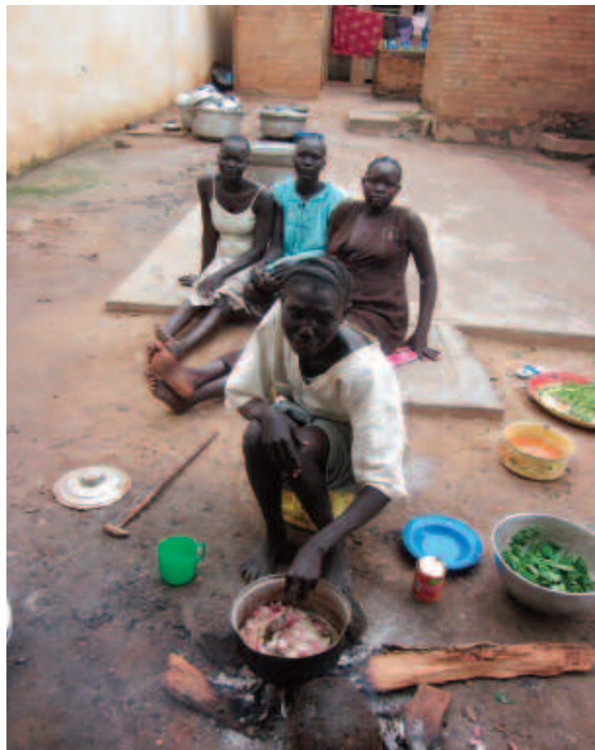
Rumbek Central Prison in Lakes State, South Sudan. Women make up a small number of the prison population and are expected to cook meals for more than 500 prisoners.