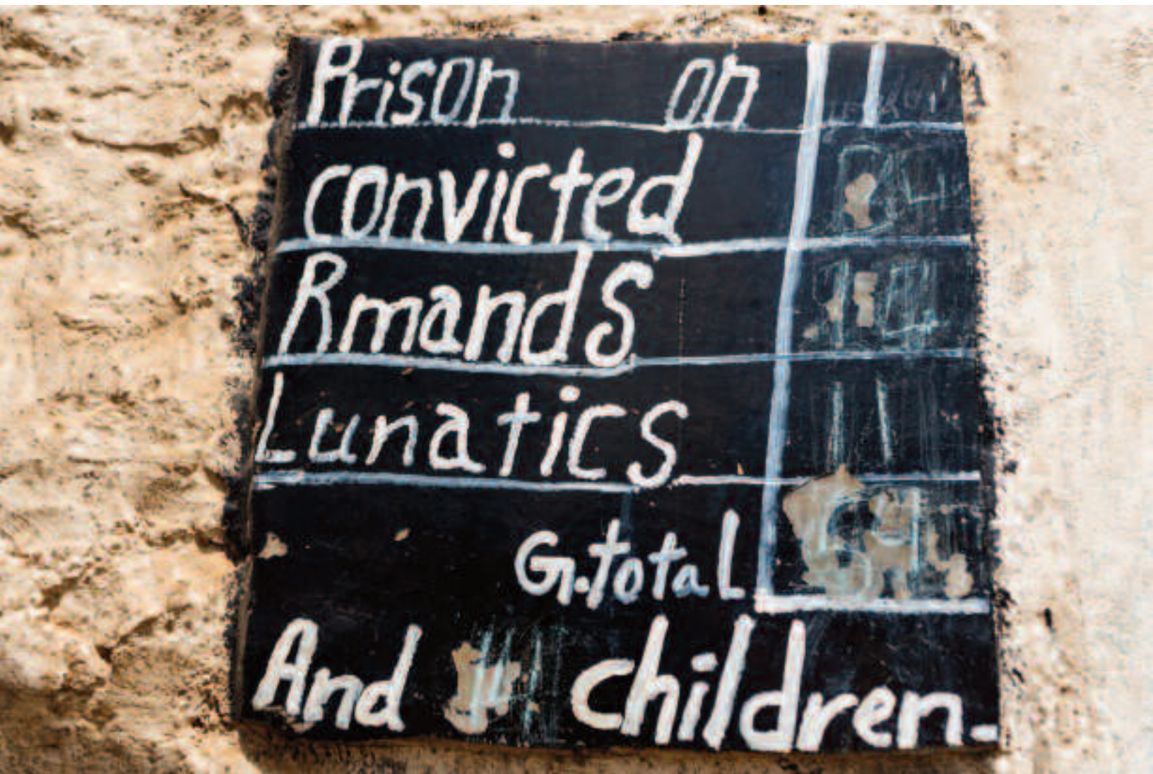
Sign showing the number of inmates in the women's section of Juba Central Prison.